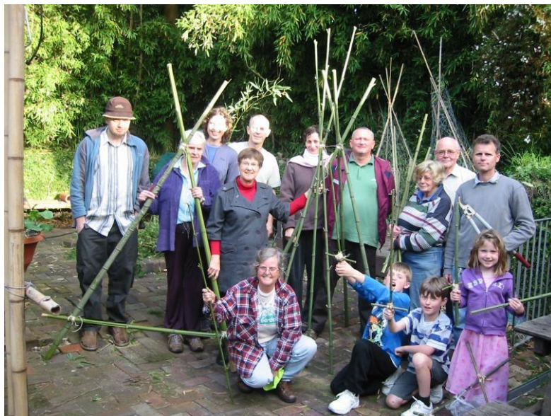
Bamboo workshop, Ku-ring-gai Local Group

If you want to connect with active permaculture people in your area, join or start a project, and learn about Permaculture by doing, then the Local Groups are a great place to start. You can find contact details for your Local Group Coordinator on the PSN Contacts Page at the back of this booklet. You can also read about the work that Local Groups are doing on our website: www.permaculturenorth.org.au